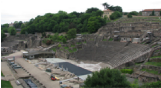
Musée Gallo romain