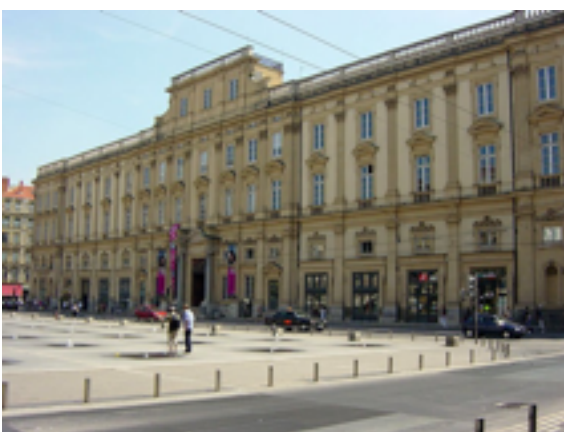
Musée des beaux arts