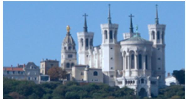
Basilique de Notre Dame de la Fourvière