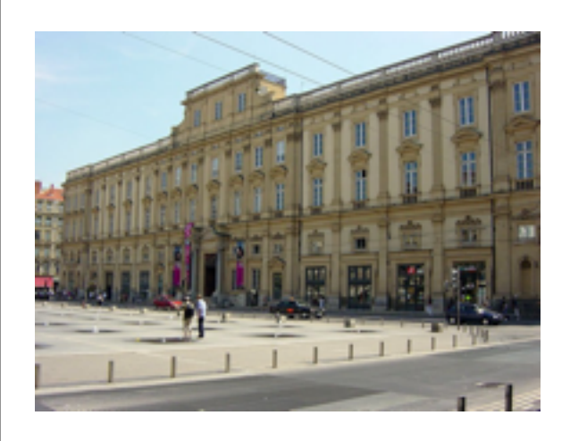
Musée des beaux arts